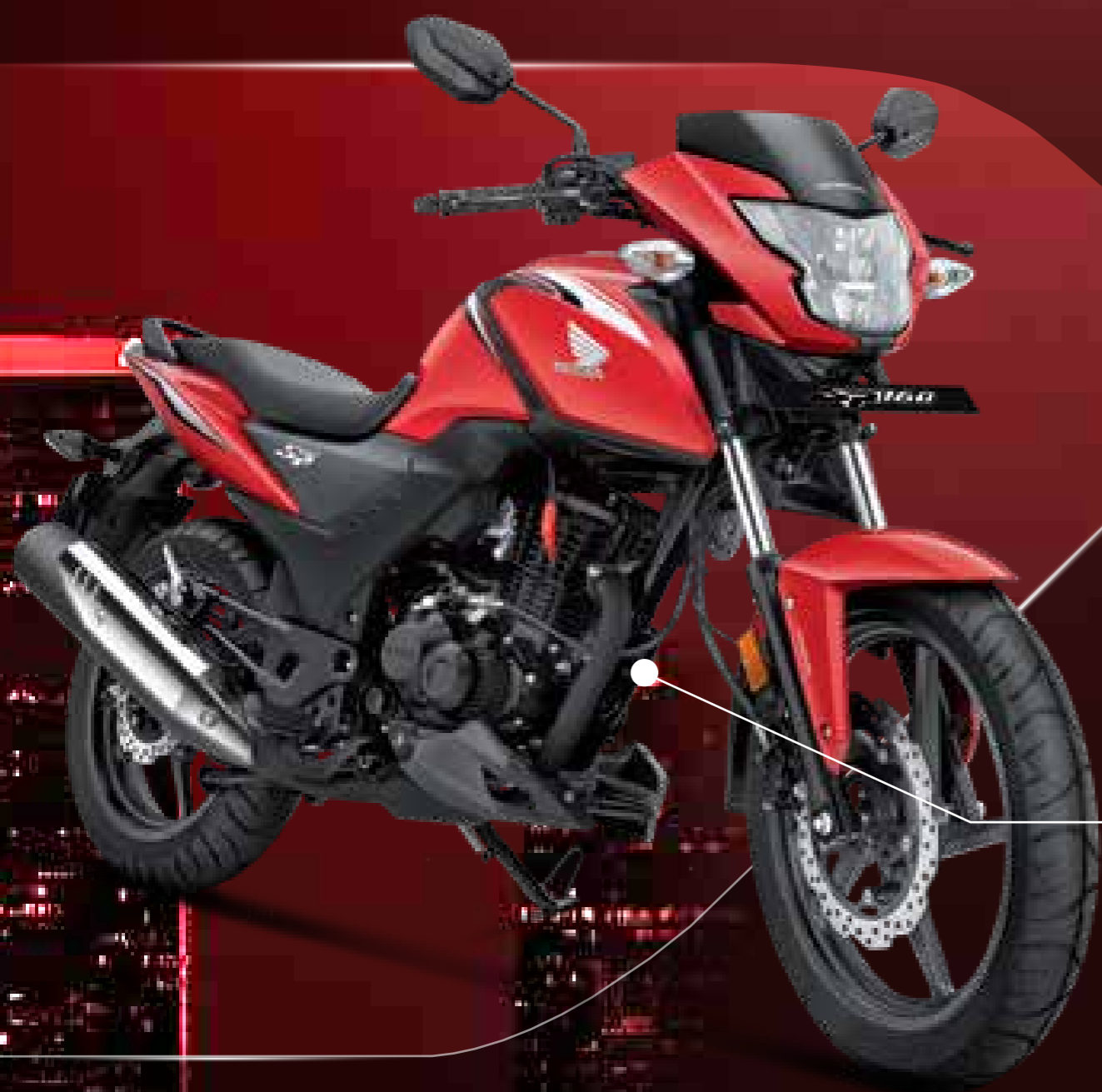
RADIANT RED METALLIC

The dynamic new color palette radiates confidence and style, making every ride a bold statement that says you've arrived.